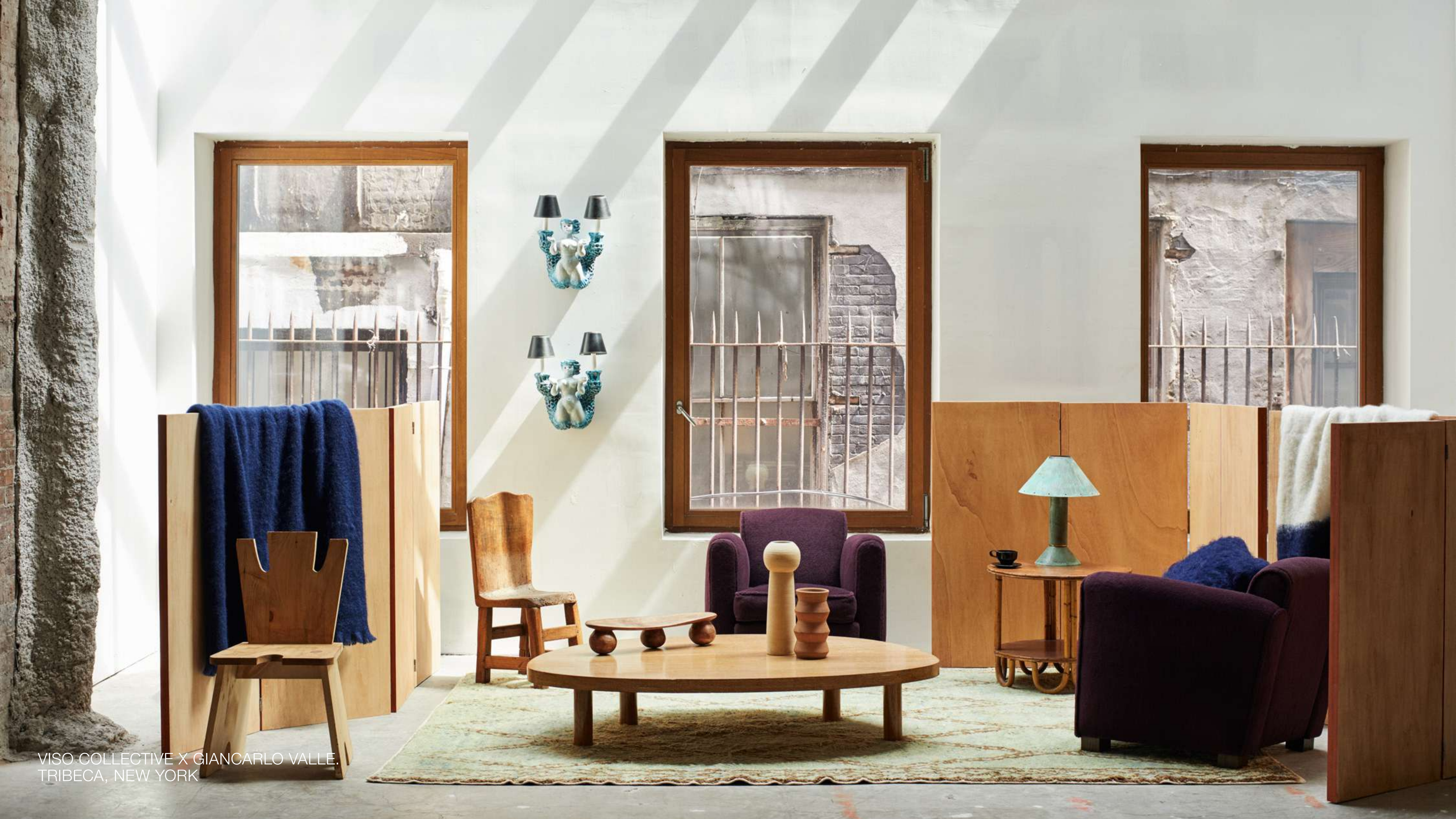
VISO COLLECTIVE X GIANCARLO VALLE. TRIBECA, NEW YORK