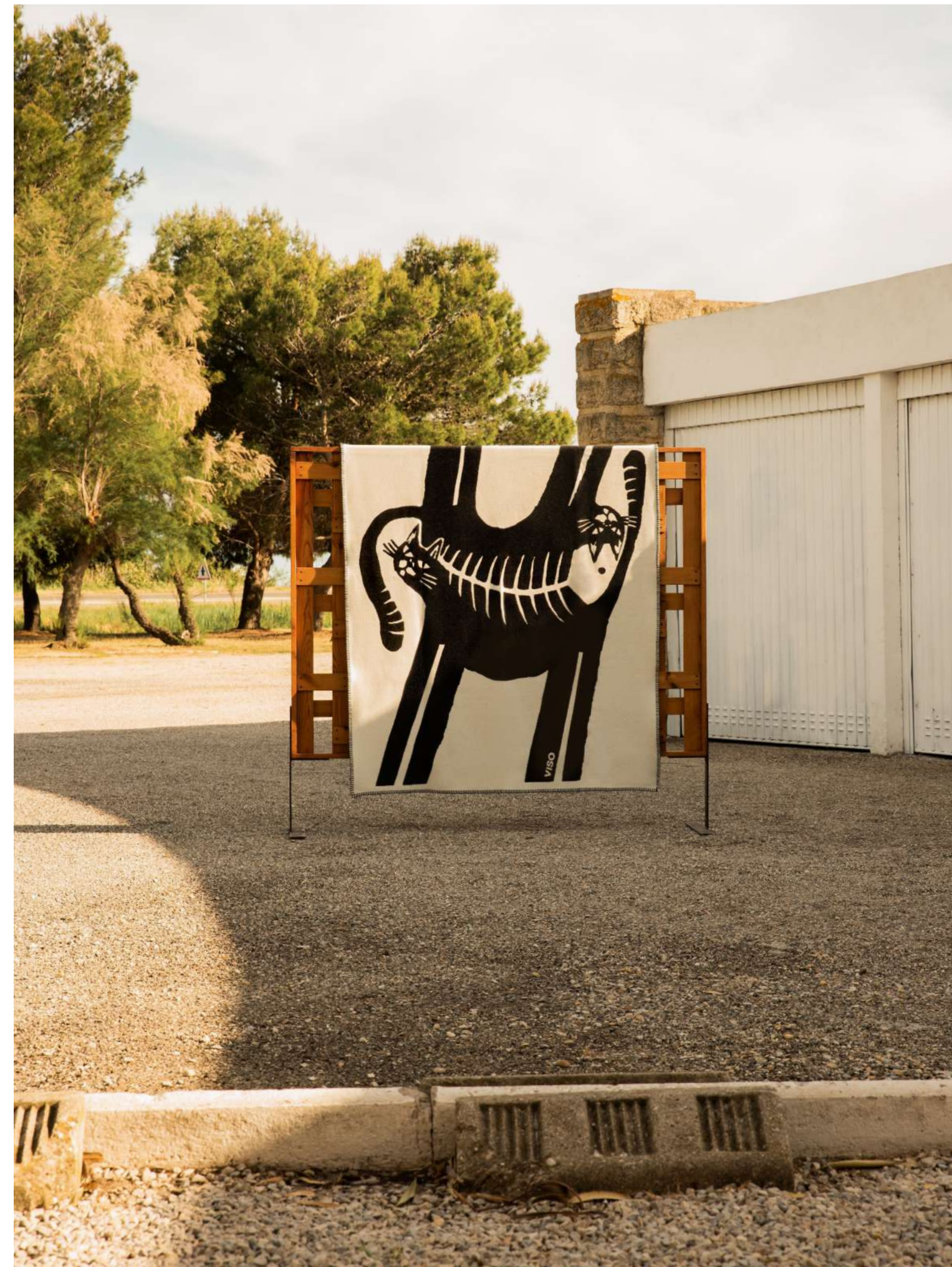
PORCELAIN TUERCAS VASE AND CUP SET AND WOOL JACQUARD CATFISH BLANKET PHOTOGRAPHED IN LOCATION IN SOUTH OF FRANCE