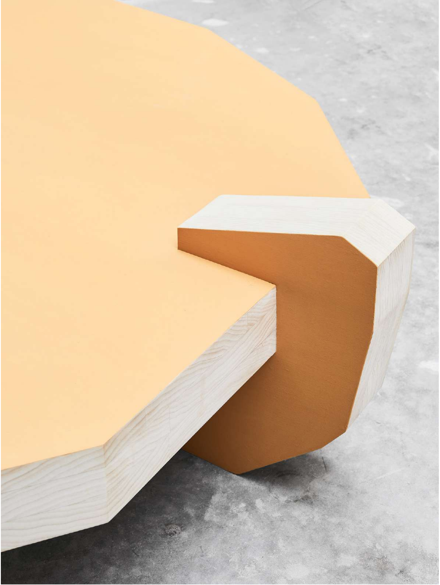
VISO X GIANCARLO VALLE/ FEATURING COLLABORATION CHISEL COFFEE TABLE 10/13