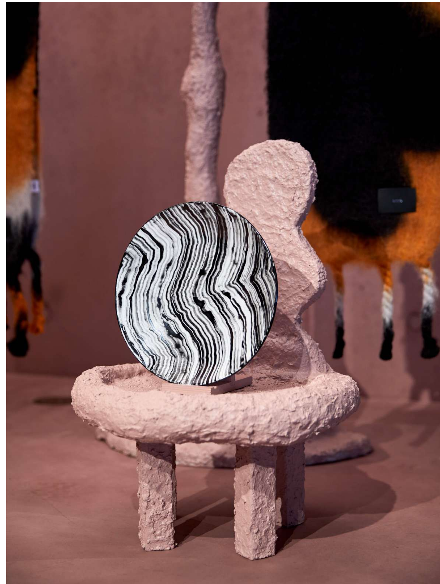
INSTALLATION DURING FRIEZE ART AT THE WEBSTER. BEVERLY HILLS, LOS ANGELES