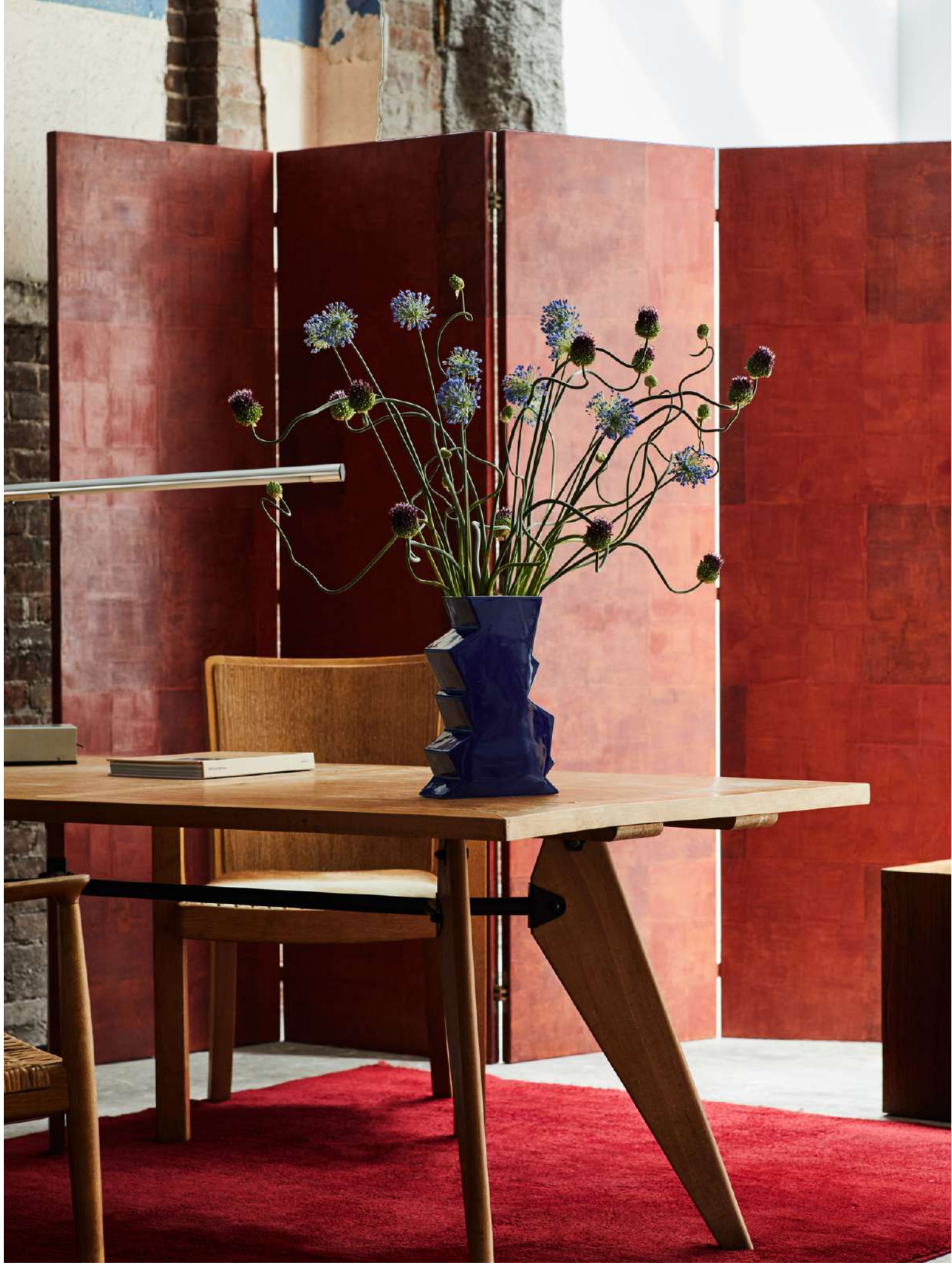
VISO COLLECTIVE X ANDRE MELLONE. TRIBECA, NEW YORK / FEATURING JAZZ VASE IN COBALT BLUE