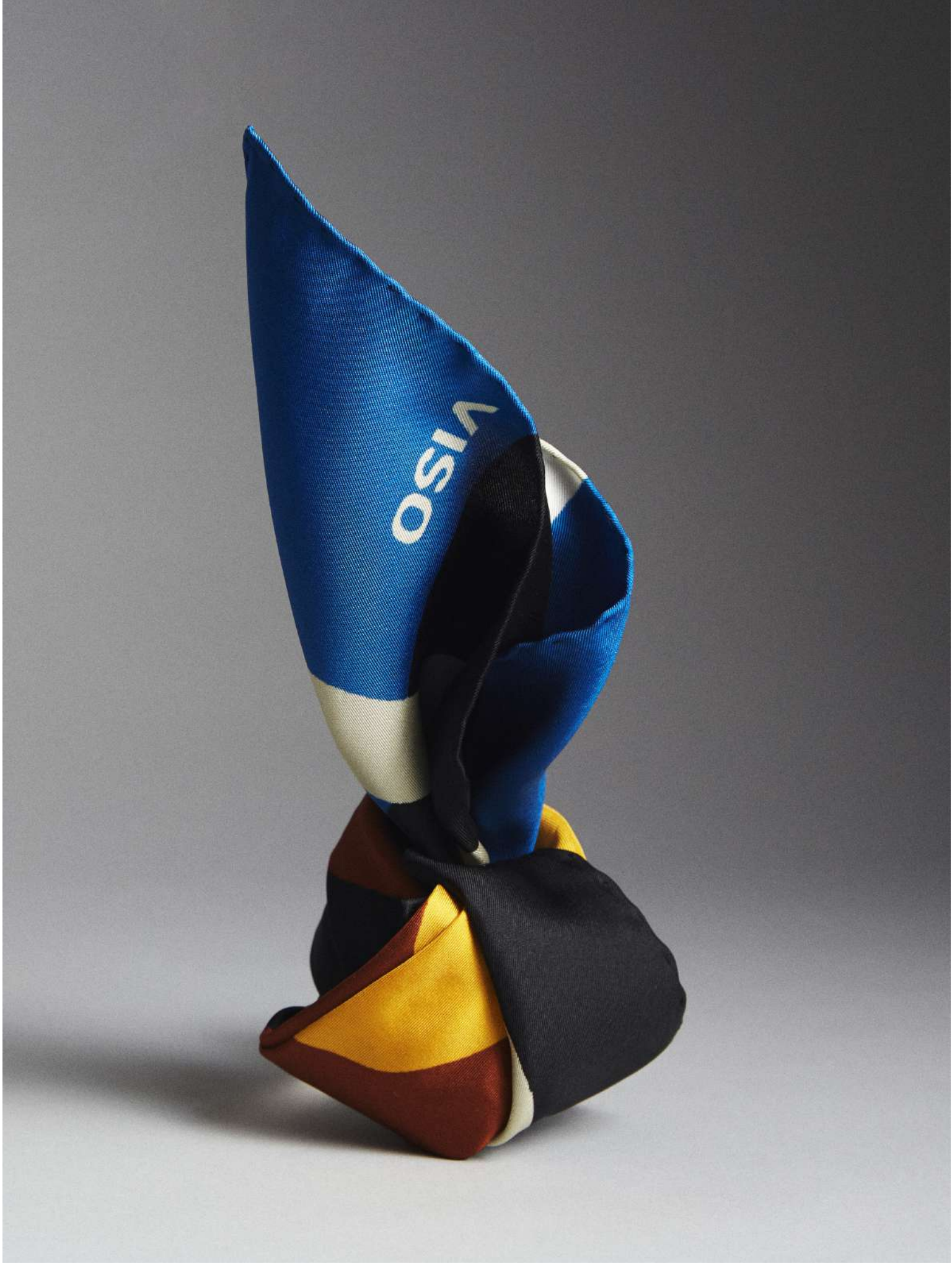
SILK HAND ROLLED SCARF PHOTOGRAPHED IN STUDIO IN NEW YORK