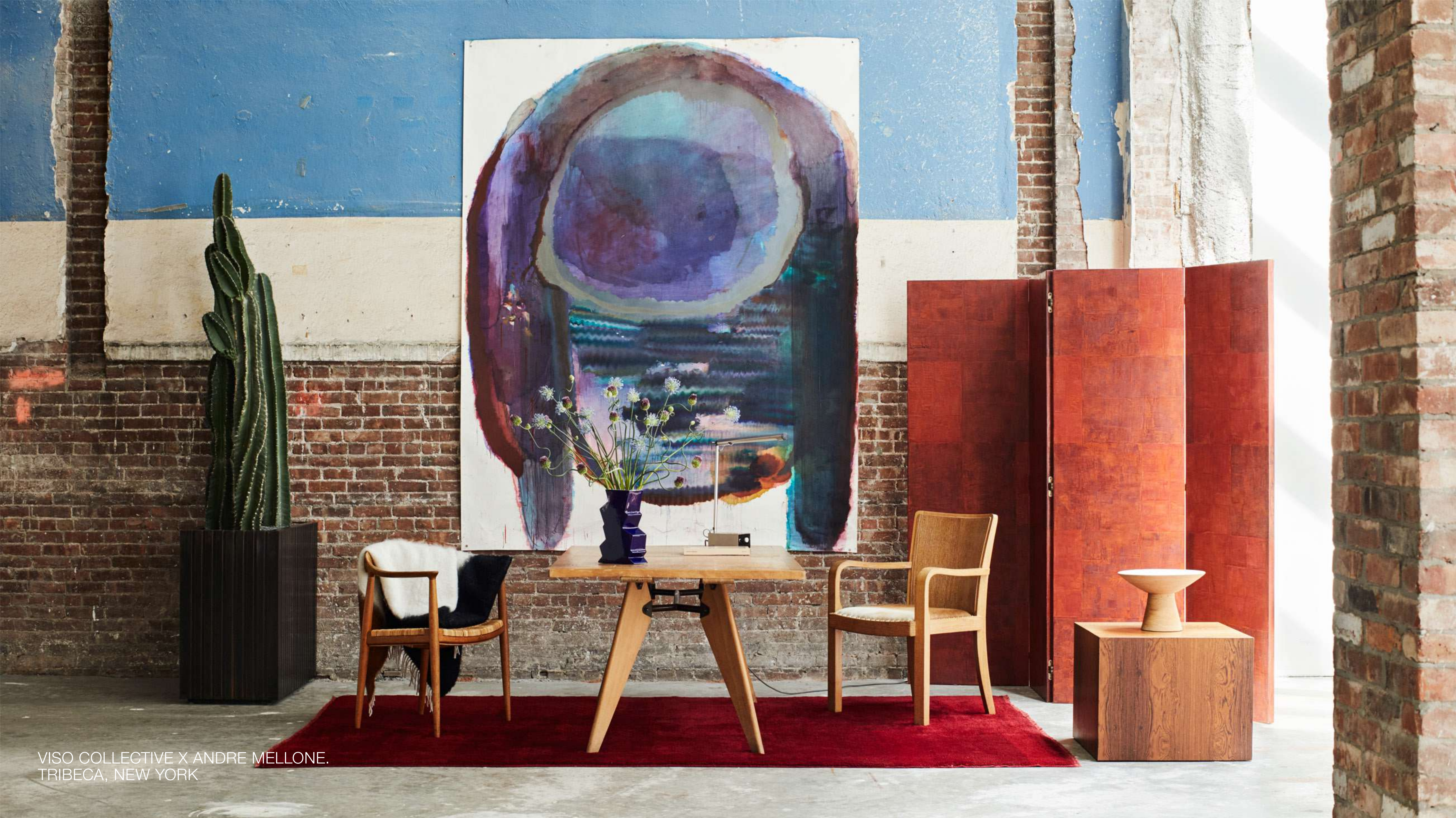
VISO COLLECTIVE X ANDRE MELLONE. TRIBECA, NEW YORK