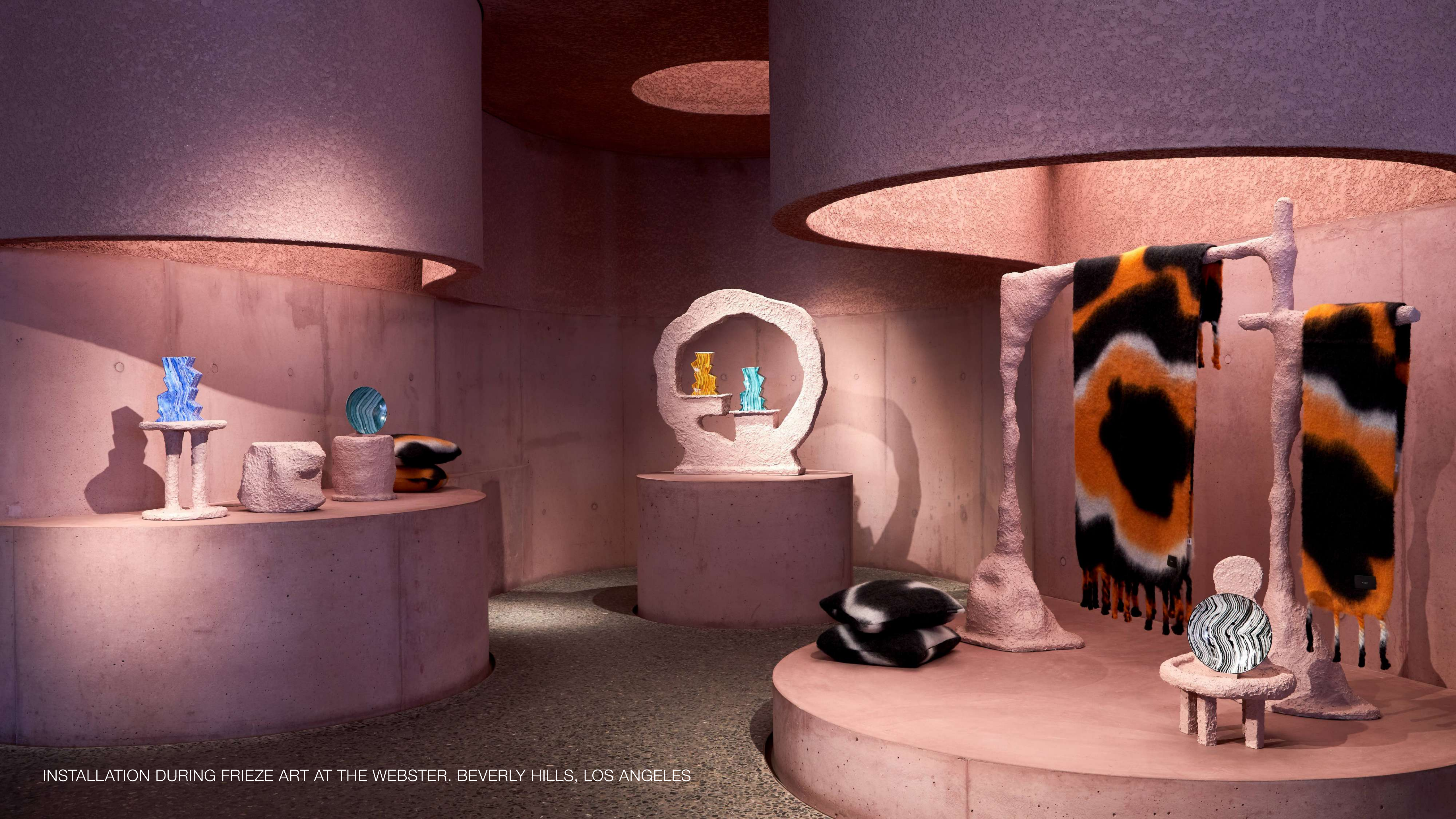
INSTALLATION DURING FRIEZE ART AT THE WEBSTER, BEVERLY HILLS, LOS ANGELES