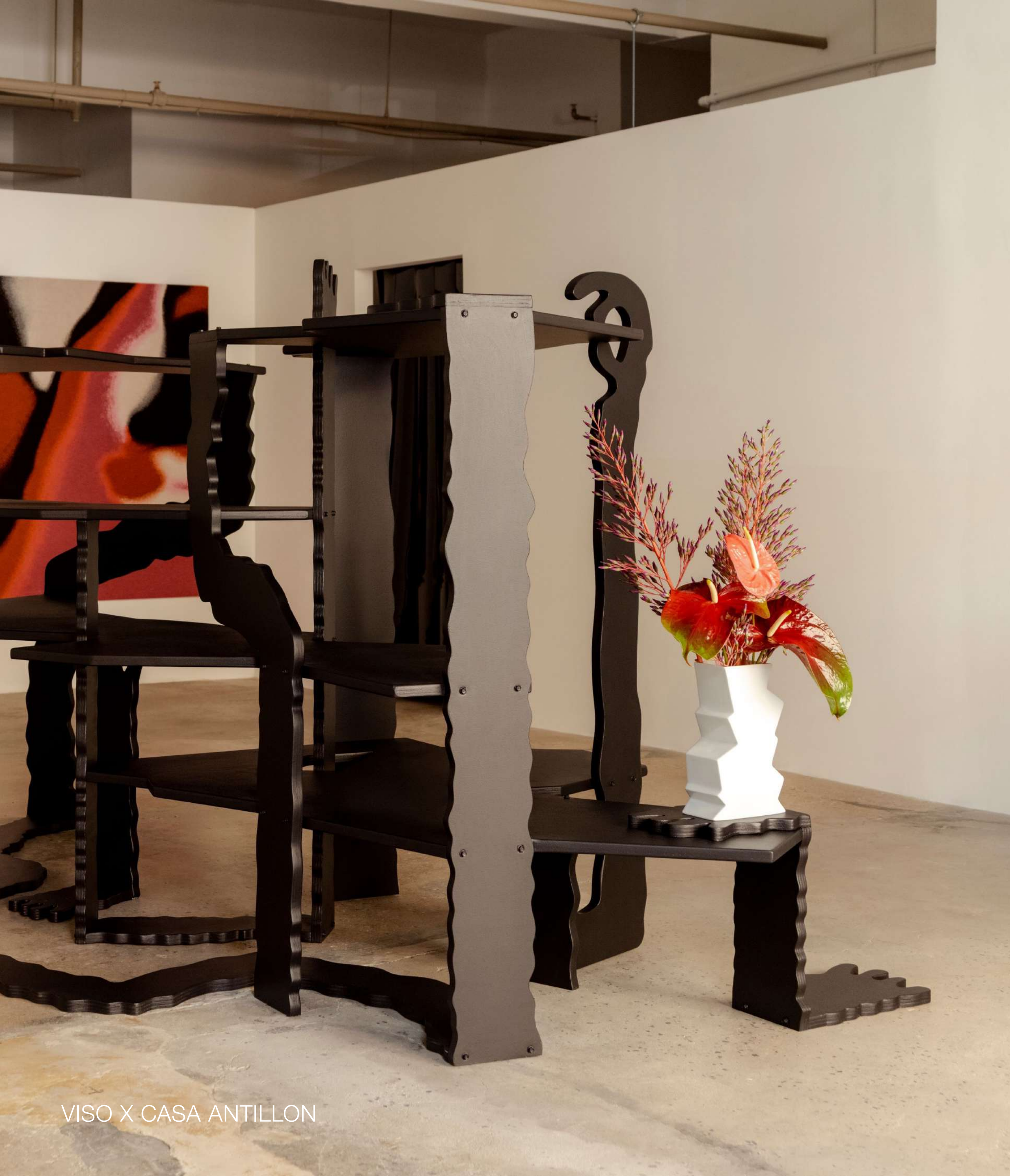
VISO X CASA ANTILLON

WHO WE ARE VISO PROJECT is a lifestyle brand based in Madrid and New York, specializing in collectible design and homeware. VISO objects, known for their graphic, form-based designs, add artistic character and utility to everyday settings. Each item is unique in design and form, reflecting the work of artisanal craftsmanship and makers worldwide. Seasonless designs and sustainable limited runs cultivate lasting quality in VISO objects.